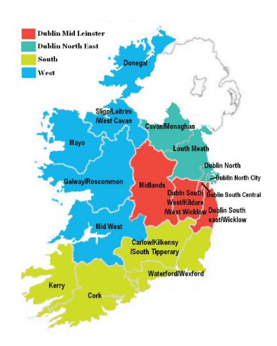
Appendix 1: Child and Family Agency (Tusla) regional organisational structure *