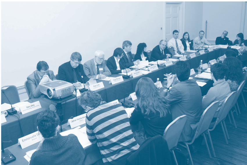
EU PEER REVIEW GROUP MEETING

3.16 ● The second question discussed in the roundtables focussed on identifying barriers and constraints to progress and how best these could be tackled. Issues identified here are summarised below in table form.