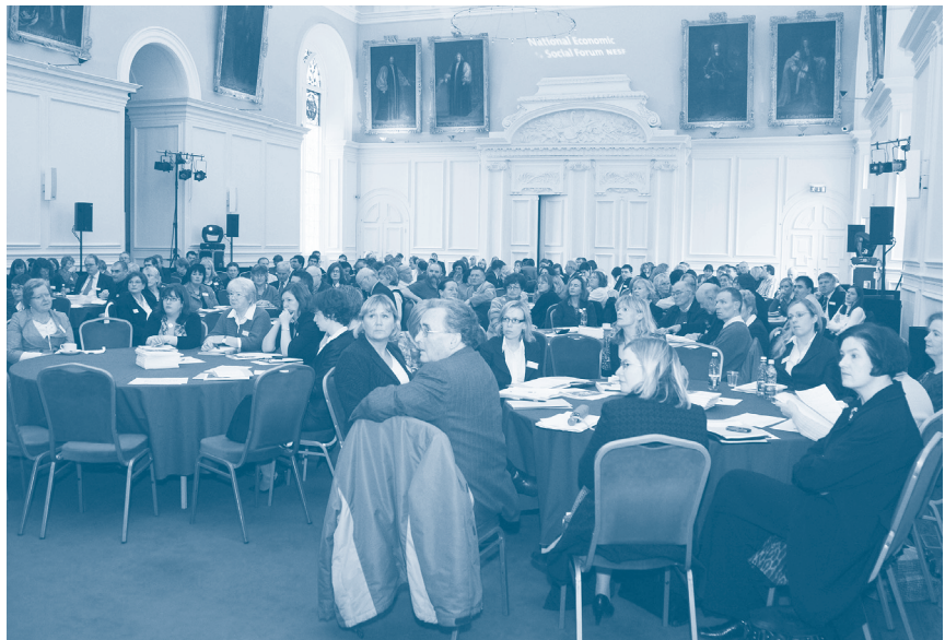
CROSS-SECTION OF THE DELEGATES AT THE FORUM