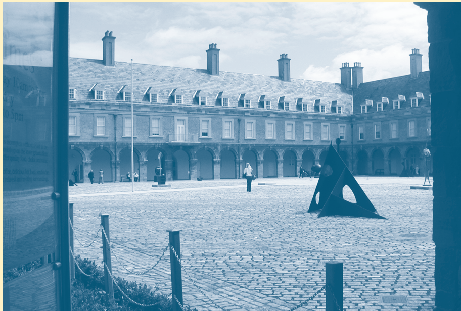
THE ROYAL HOSPITAL KILMAINHAM