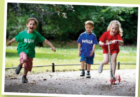
Enjoying the launch of Run, Walk and Roll

120 breast and colorectal cancer survivors participated and showed significant improvements in fitness with all groups reaching the required targets. Case studies also showed a positive impact on daily activities and the management of lymphoedema.