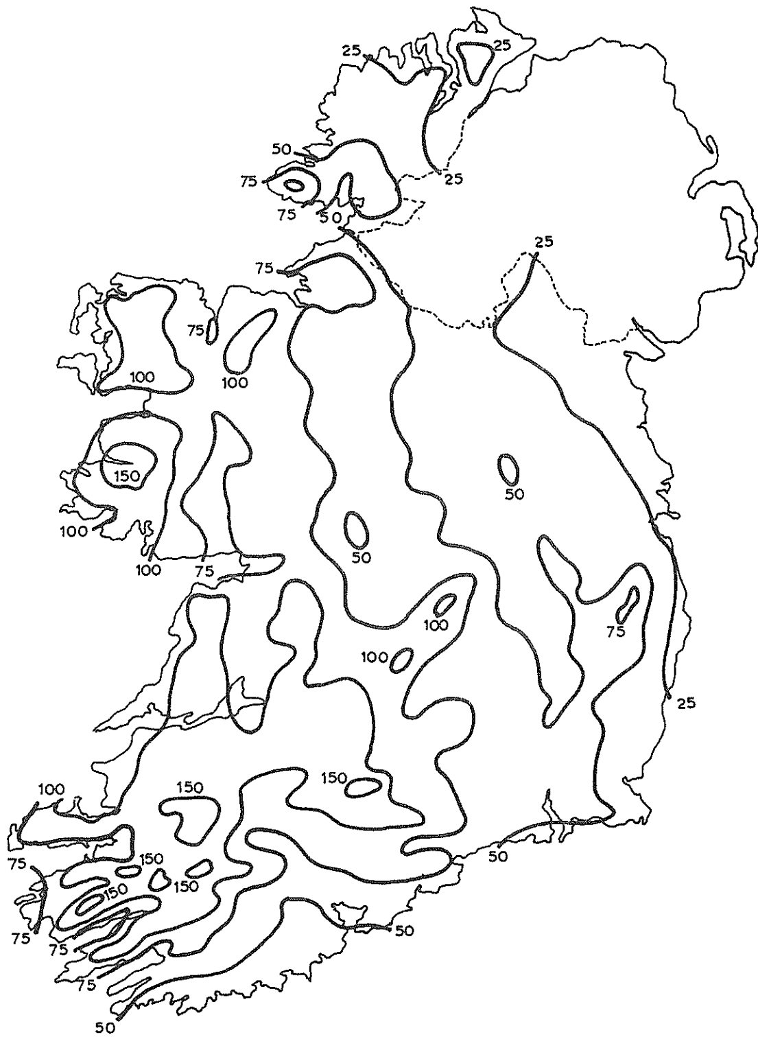
Fig. 2. Amount of precipitation (mm) for the 4-day period ending at 0900 GMT on 1st December 1973