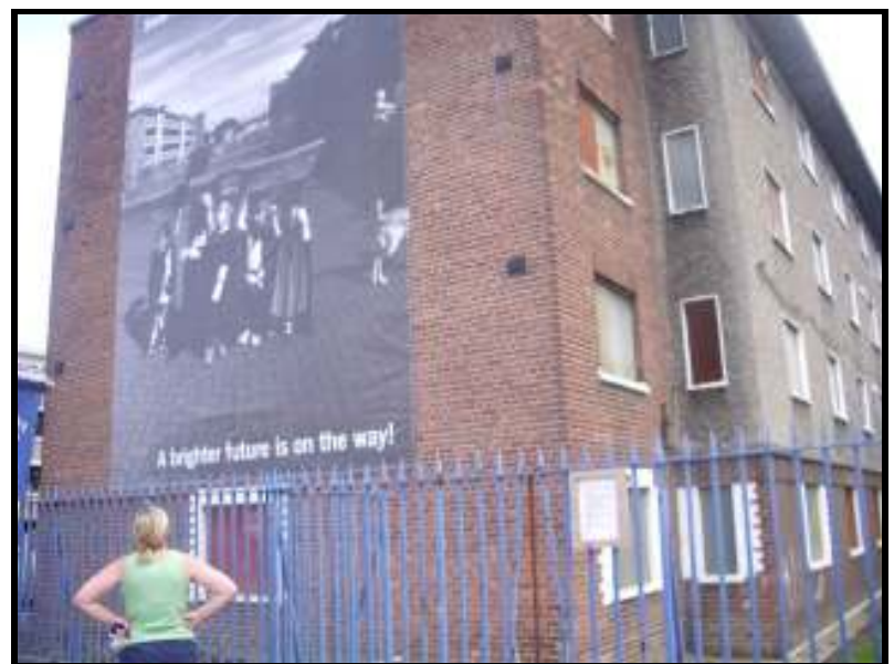
Fatima Mansions before regeneration

“The Regeneration Solution” is a proposal to the Government for legislation to establish a national programme for regeneration of public housing estates. While it draws on the experience of the estates above, it takes a human rights approach based on both the Universal Declaration of Human Rights and the European Convention of Economic, Social and Cultural Rights. Ireland is a signatory to both of these documents and they both guarantee the right to adequate housing.