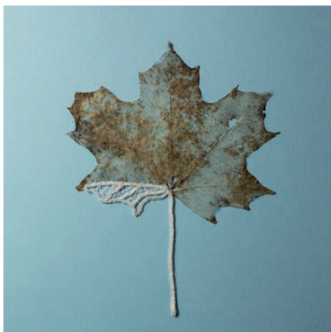
Saïdhbhín Gibson 'Make Good, Make Better-Ace' 2014