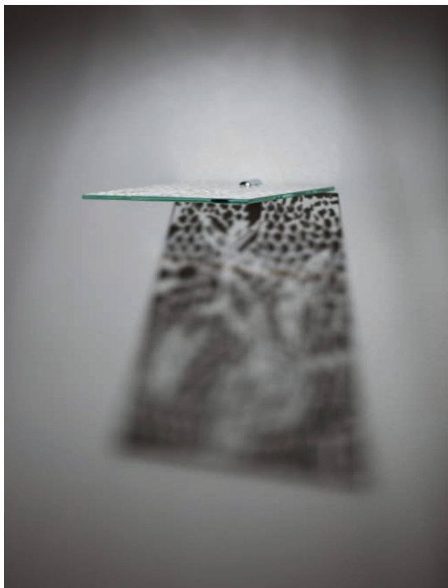
Patty Murphy 'Interweave' 2013