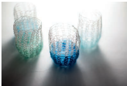
Cathryn Hogg 'Oscillation II' 2014