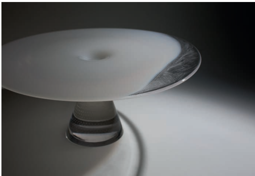
Róisín de Buitléar 'Moon Shadow' 2014