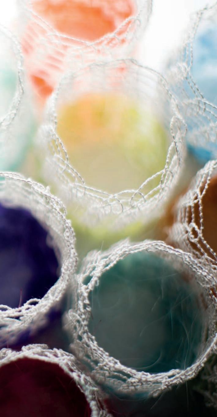
Cathryn Hogg 'Oscillation II' 2014