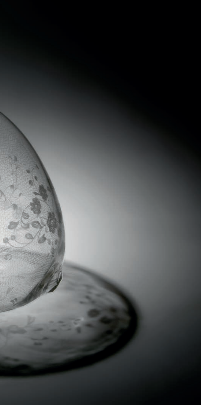
Róisín de Buitléar 'Time Spent' 2010 (Collection of the National Museum of Ireland)