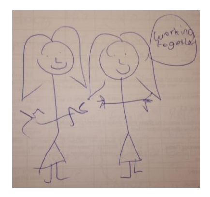
Figure 1. Sample drawings depicting learning collaboratively.