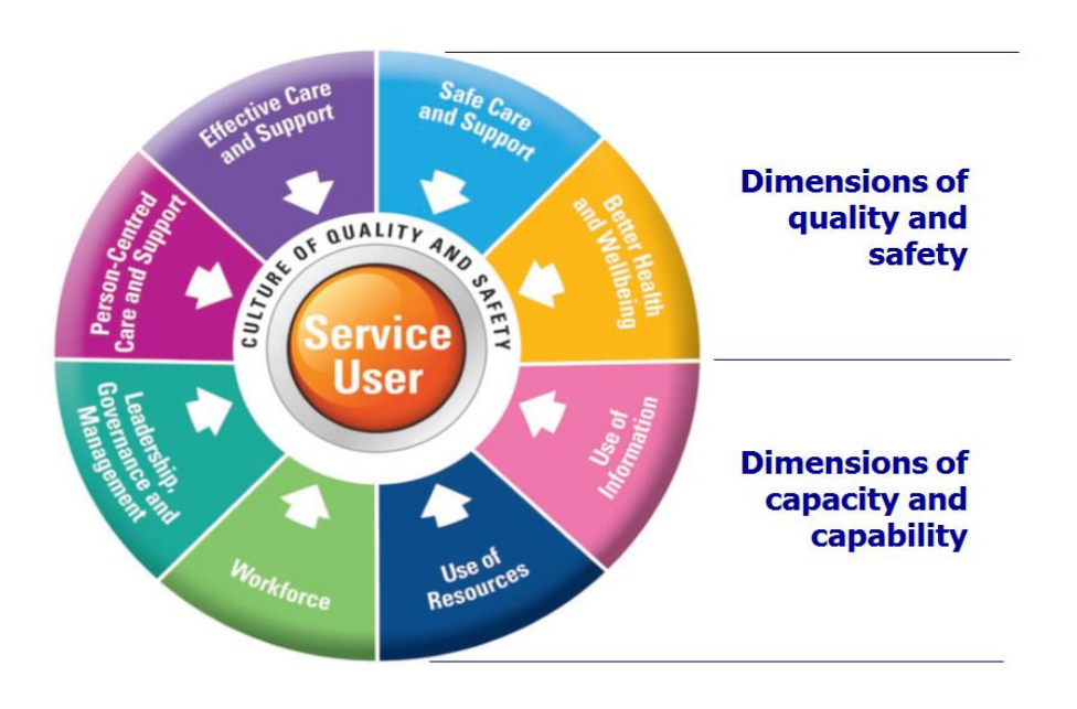
Figure 1: National standards for infection prevention and control of healthcare-associated infections in acute healthcare services (2017)

Under each of these dimensions, the standards<sup>*</sup> are organised for ease of reporting.