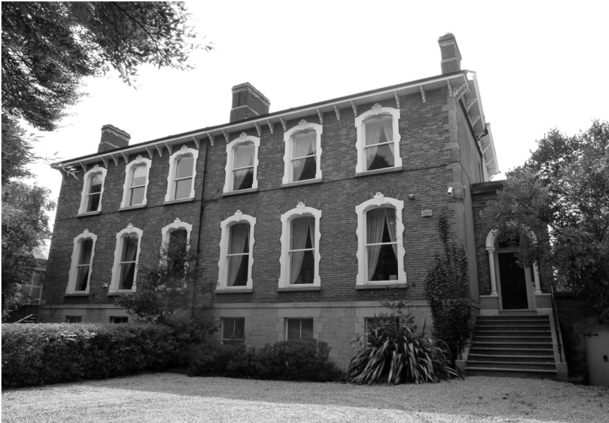
2.5 Meade's houses, Ailesbury Road, Dublin (photograph by the author).