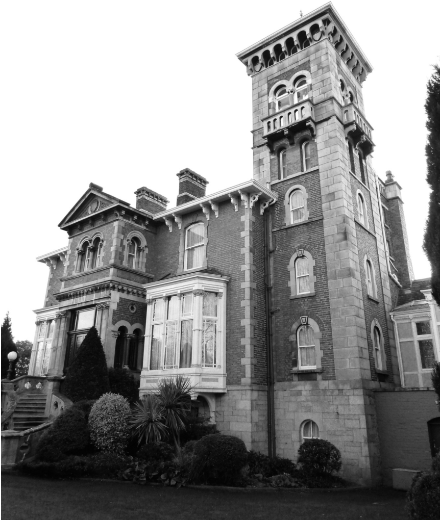
2.4 St Michael's house, Ailesbury Road, Dublin.

professionals, or those in the upper levels of the public service. 24 These high-quality structures have ensured that Ailesbury Road remains one of the most valuable pieces of real estate in Dublin today.