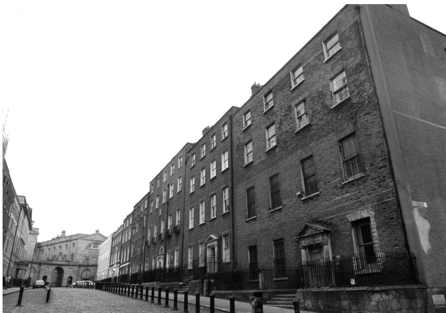
2.8 Nos 3–10 Henrietta Street, Dublin.