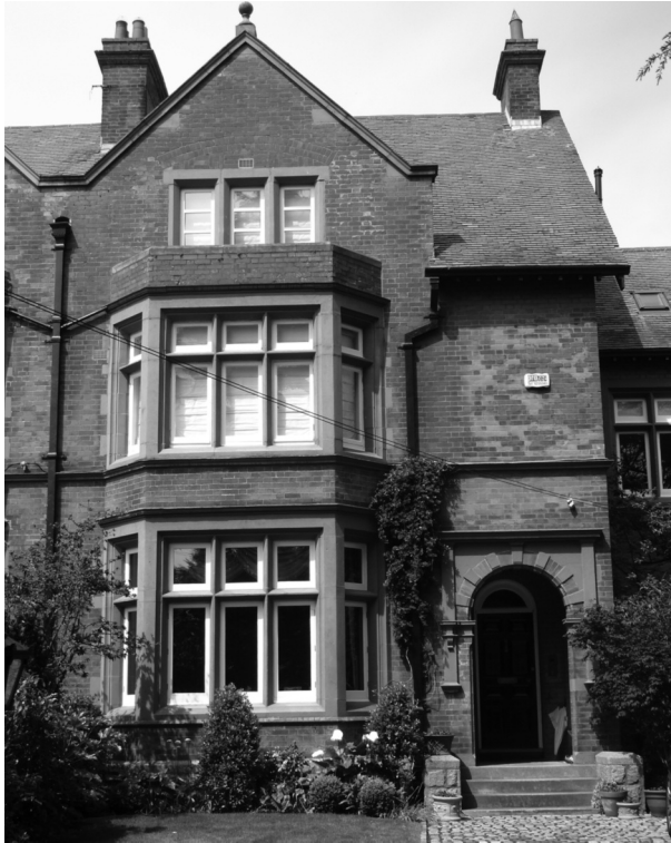
2.10 Shrewsbury Road houses, Dublin.