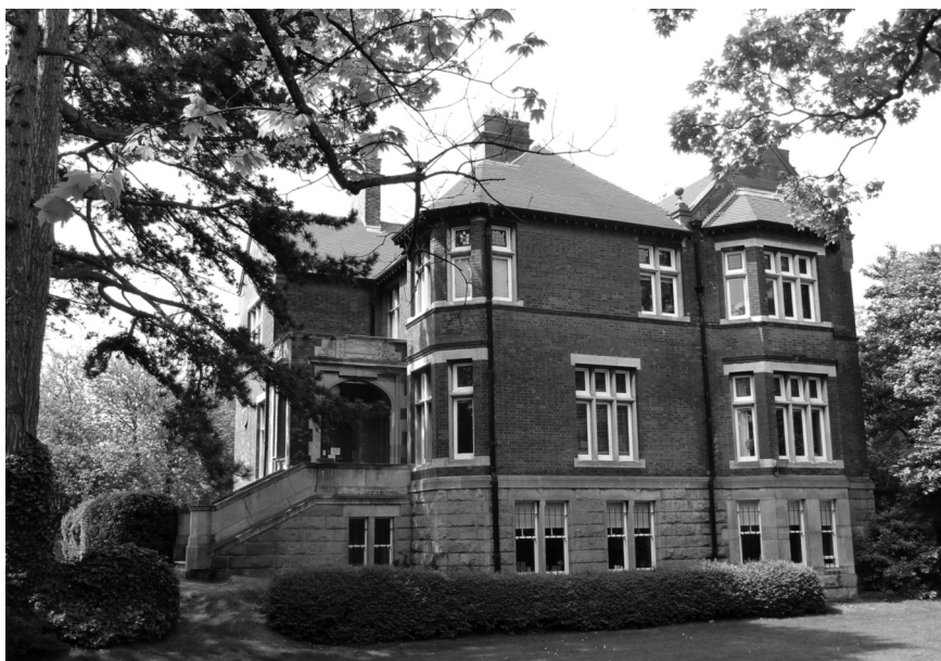
2.9 Shrewsbury House, Dublin (photograph by the author).