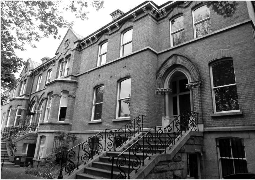
2.6 Nos 46–52 Northumberland Road, Dublin.