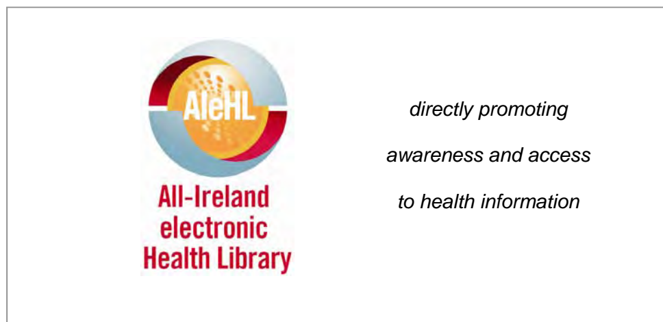
Figure 1. All-Ireland electronic Health Library