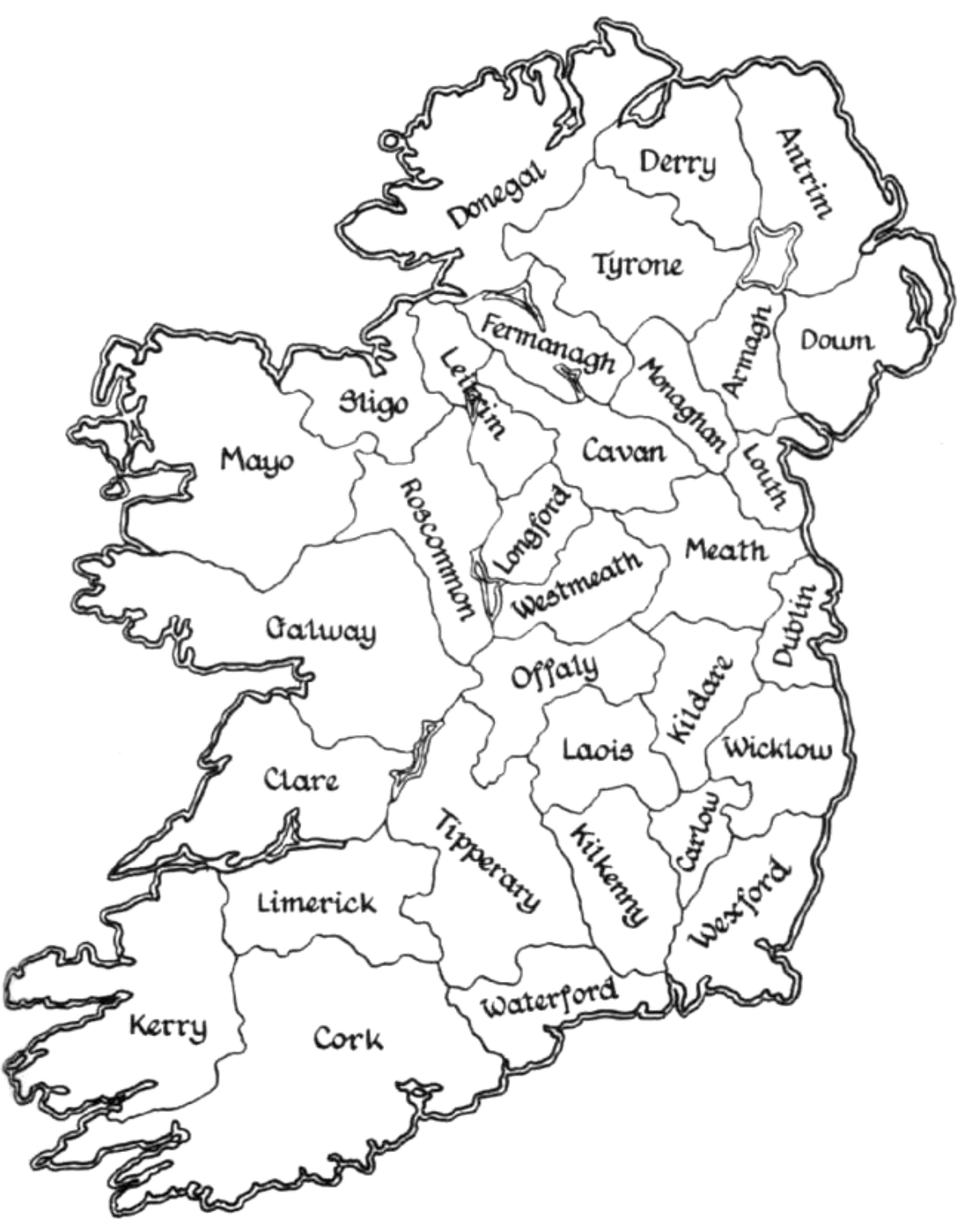
FIGURE 1. The counties of Ireland.