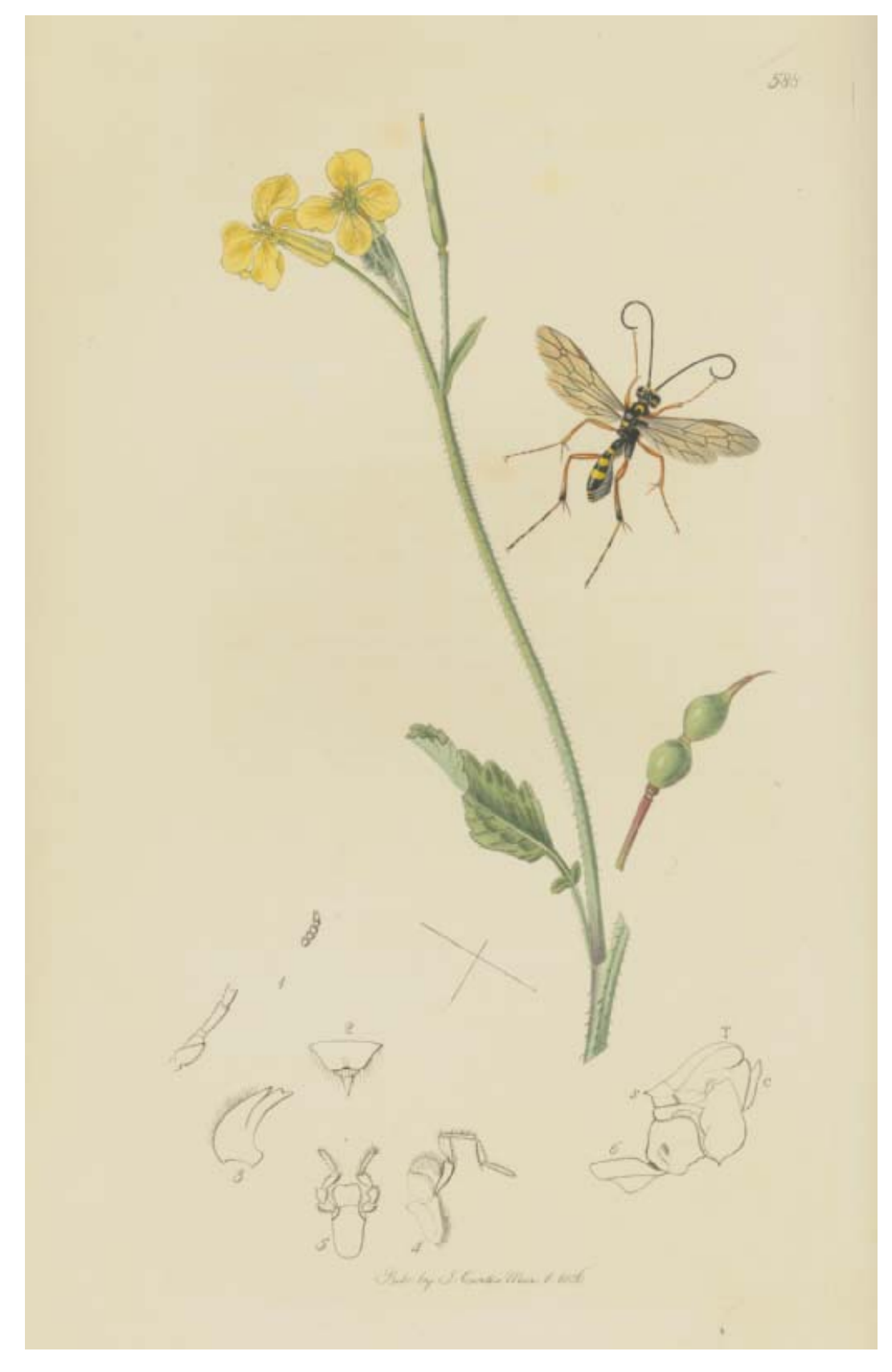
Plate 3. Banchus farrani.