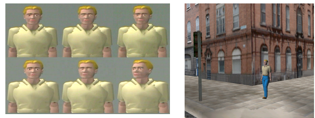
Figure 2. Animation frames from the gaze generator for three different eccentricities (left). Gaze generator at work in a virtual city environment (right).