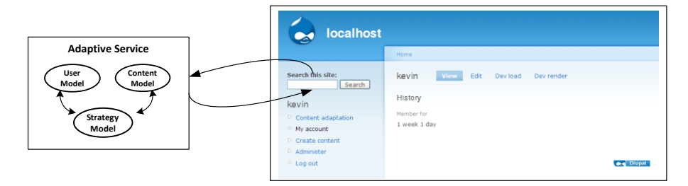
Figure 2 exemplifying a basic adaptive integration within the Drupal WCMS.

As indicated in figure 2 the basic Drupal search module was activated. Furthermore the Drupal hook_search_preprocess is used to intercept the user's query and send it to the Adaptive Service. In addition to the query interception, content related user activities are logged with Drupals node_hook_api . It registers content related activities and saves these in the underlying database. This information is then used to extend the user model of the Adaptive Service.