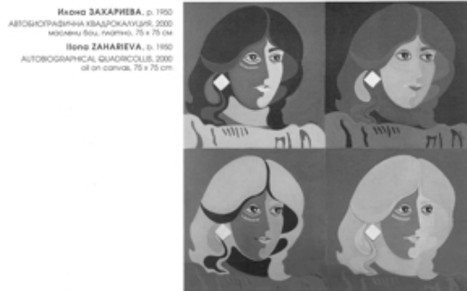
Figure 3 Ilona Zaharieva