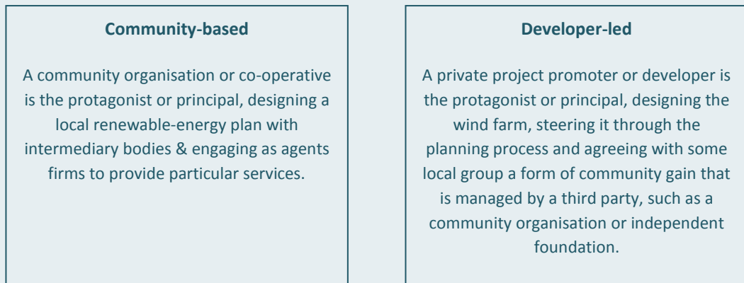
Figure 6.1: Two Polar Models of Renewable-Energy Project

In one model, a large majority of the 180 existing wind-energy projects in Ireland can be described as developer-led (summarised in the right-hand box in Figure 6.1). In these, a private (and sometimes public) project promoter makes a contract with land owners and the grid regulator to establish a wind farm, and the degree of engagement with the local community varies. From this perspective, the task of building greater community acceptance and social support is to identify policies to encourage project promoters and developers to engage earlier and more fully with local communities, and to enter into more generous community-gain settlements. Indeed, the Irish Wind Energy Association (IWEA), has developed voluntary guidelines along these lines.