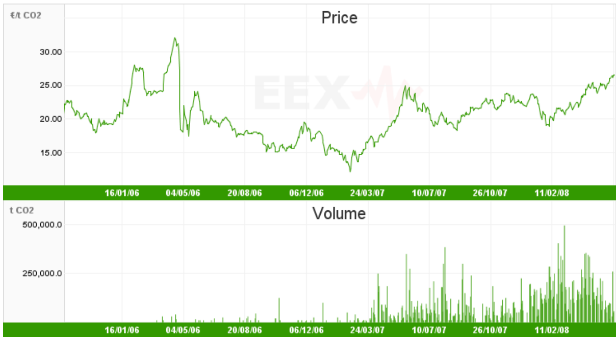
Figure 3: Derivatives price (Second Period European Carbon Futures – 2008) – from www.eex.com