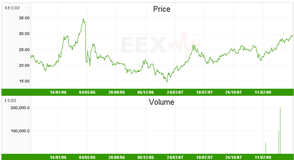
Figure 4: Derivatives price (Second Period European Carbon Futures – 2012)

Another market for carbon-based derivatives has emerged on foot of the Kyoto Protocol: a market for Certified Emissions Reductions (CERs), where each CER is equivalent to one metric tonne of CO 2 reduction.