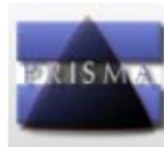
PRISMA 2009 Flow Diagram