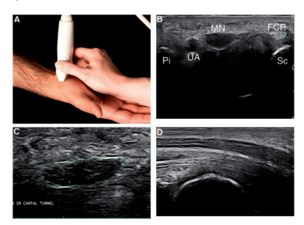
(A) Demonstration of probe position on the antral wrist for examination of the median nerve. (B) View of carpal tunnel with surrounding structures. MN: median nerve; FCR: tendon of the flexor carpi radialis; Sc: scaphoid bone; UA: ulnar artery; Pi: pisiform bone. (C) Tracing method to measure cross-sectional area of enlarged median nerve measuring 18 mm<sup>2</sup> in a male with CTS. (D) Longitudinal view of the median nerve showing enlargement as it enters the carpal tunnel in a female patient. CTS: carpal tunnel syndrome.

Fig. 1 Images of probe position and US in carpal tunnel syndrome