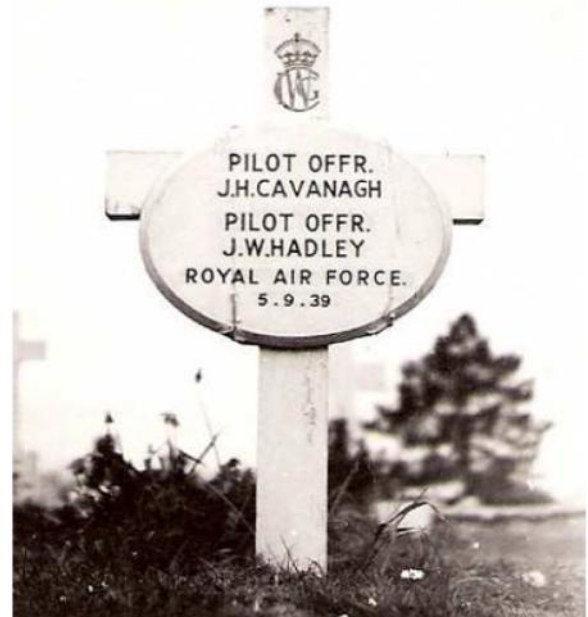
Original Grave Marker Holy Trinity Churchyard Calne, Wiltshire