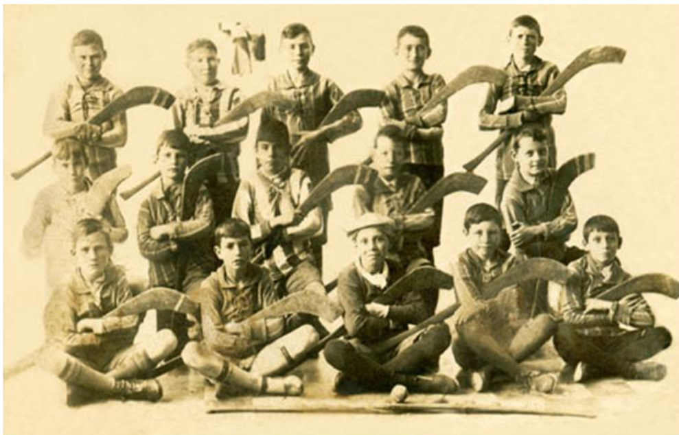
The Fahy Boys, c. 1926

There was a revival of hurling in 1920, but due to the fall off in new immigration and the lack of hurleys during WW II the game went into terminal decline.