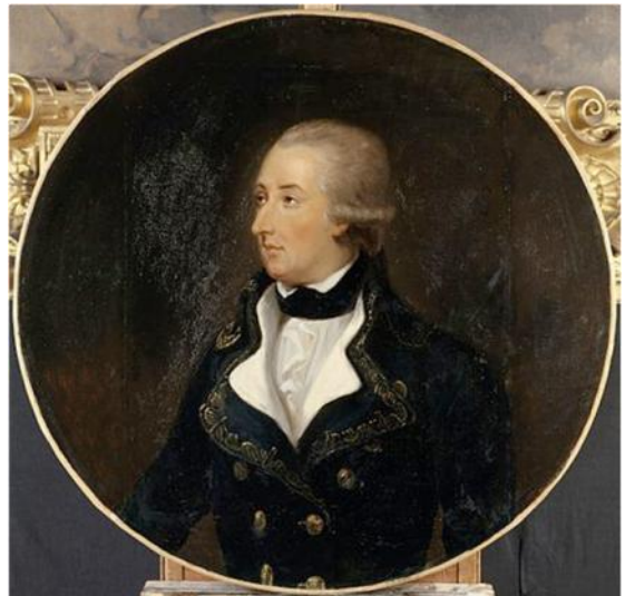
General Arthur Comte de Dillon

Dillon's friendship with Desmoulins plus the intrigues against him of an army officer named Dumouriez who was jealous of Dillon's appointment as Commander in Chief of the Army of the North, following General Lafayette's defection, as well as the perception of Dillon's aristocratic status, all combined to seal his fate.