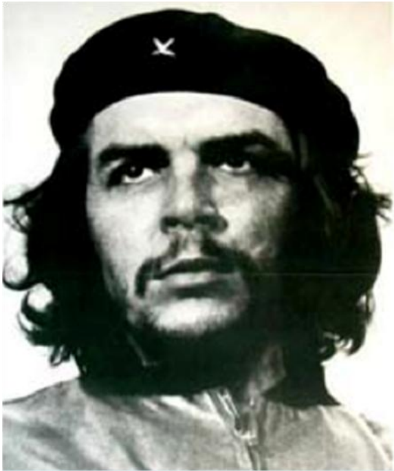
Ernesto Che Guevara Lynch