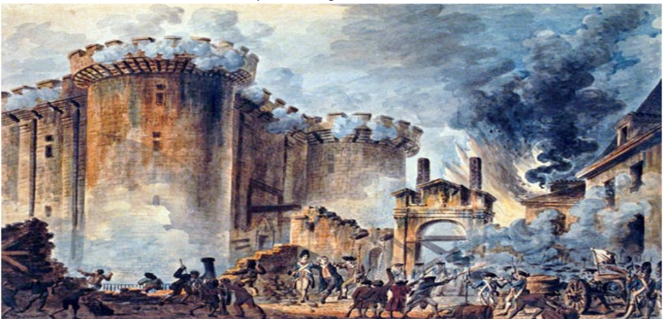
The fall of the Bastille ( by Jean-Pierre Houël)