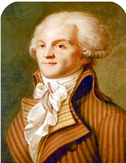
Maximilien de Robespierre

In the light of rumours of a plot to free the criminals in the overcrowded Parisian jails, Jean-Paul Marat called for the execution of the alleged conspirators and a mob of sans-culottes emerged to follow his lead. This was the beginning of what became the "Reign of Terror" (which lasted until July 1794) under the leadership of