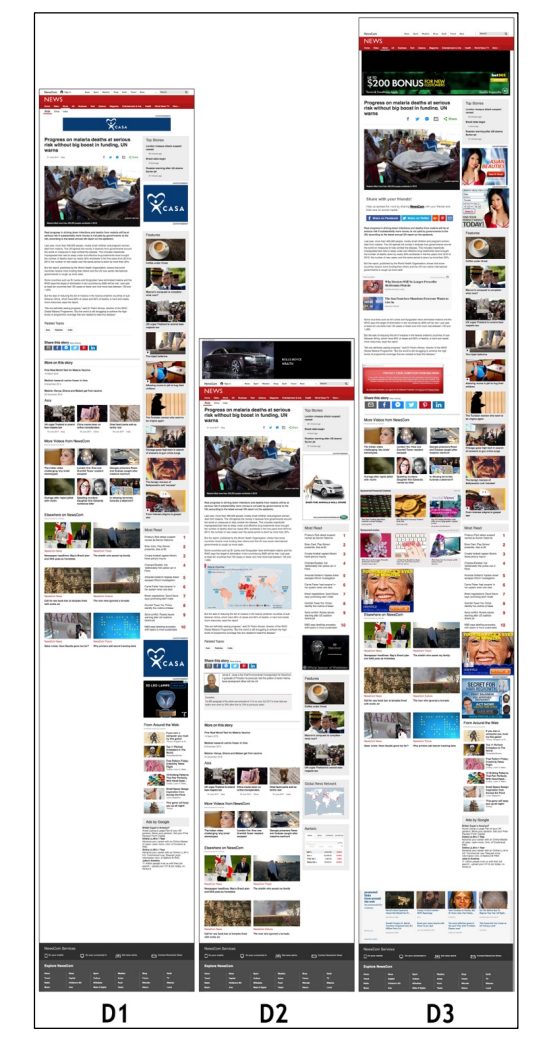
Figure 1 Three versions of the BBC website. D1 is the original, D2 is the version designed to improve the quality of the design and reduce the perception of Bias and D3 is the distortion designed to reduce the quality of the design and increase the perception of bias.

A post-hoc test to compute achieved power with the 405 submissions revealed a >.95 actual power of detecting an effect size of 0.24. Four measures were also taken to increase validity. 1) Upon beginning the study, participants undertook two instruction tasks explaining how to use the experiment interface. 2) Two spike tasks were added to measure attention. 3) Participants were provided a second opportunity to comparatively re-evaluate their ratings (Spillane et al., 2017b). 4) No emotive topics were used. A Visual Analogue Scale (VAS) from 0-100 was used to measure perceived bias.