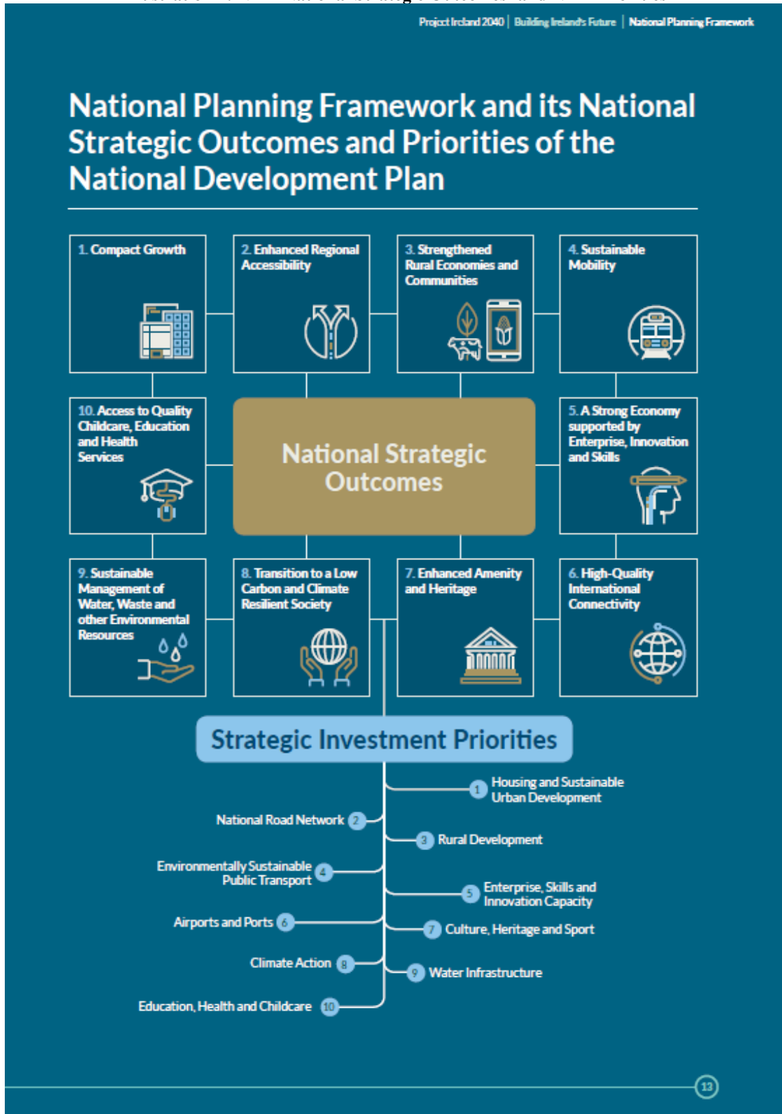
Illustration 2: NPF ‘National Strategic Outcomes’ and NDP Priorities

Ultimately, the NPF strategy seeks to influence locational choice of firms and individuals. More than ever before, the relative attractiveness of places in Ireland to talent & enterprise, will enable regional & local ambition to be realised.