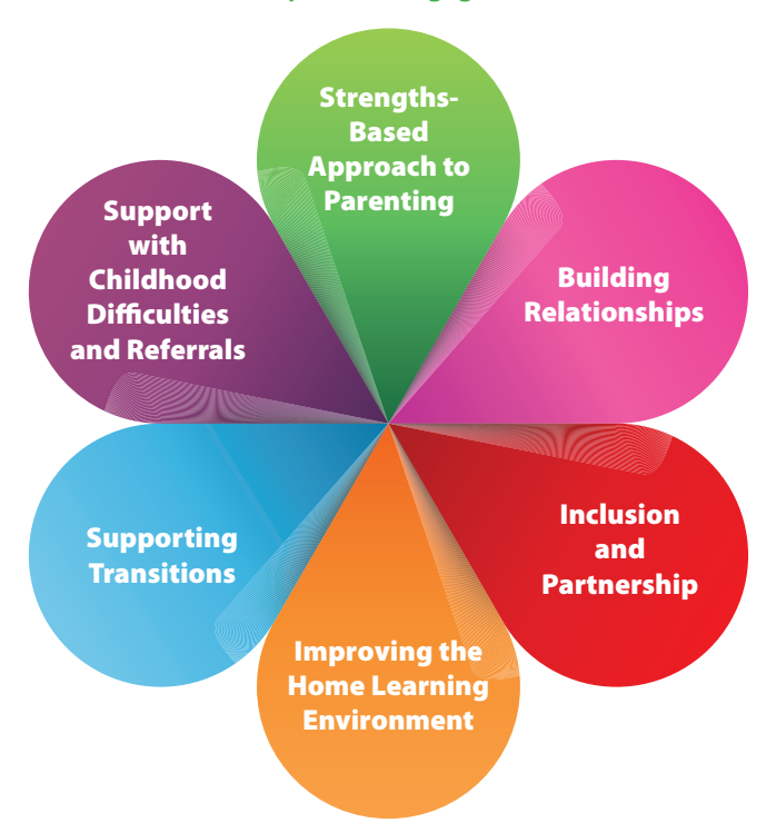
Figure 2.1: CDI's model for parental engagement