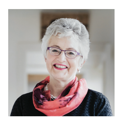
Katherine Zappone Minister for Children & Youth Affairs

I very much welcome this Toolkit as a resource in guiding best practice in the area of parental engagement in early learning and care services and I am confident that it will be an invaluable resource for practitioners.