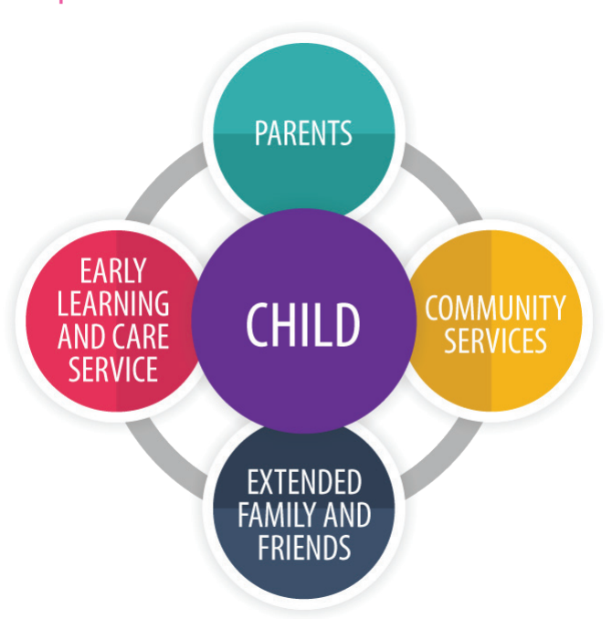
Figure 2.2: Building relationships

It is recommended that the process of building strong relationships and engaging in partnership with parents begins even before the child starts attending the early learning and care service.