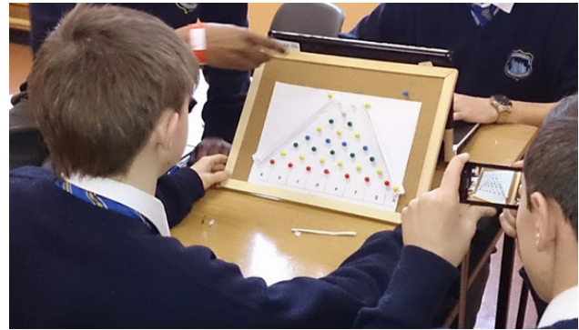
Figure 2: Plinko and probability

The first day's activity was 'Plinko and Probability', which encourages students to develop a deep conceptual understanding of patterns, Pascal's triangle, probability and bias. Plinko is a game of chance based