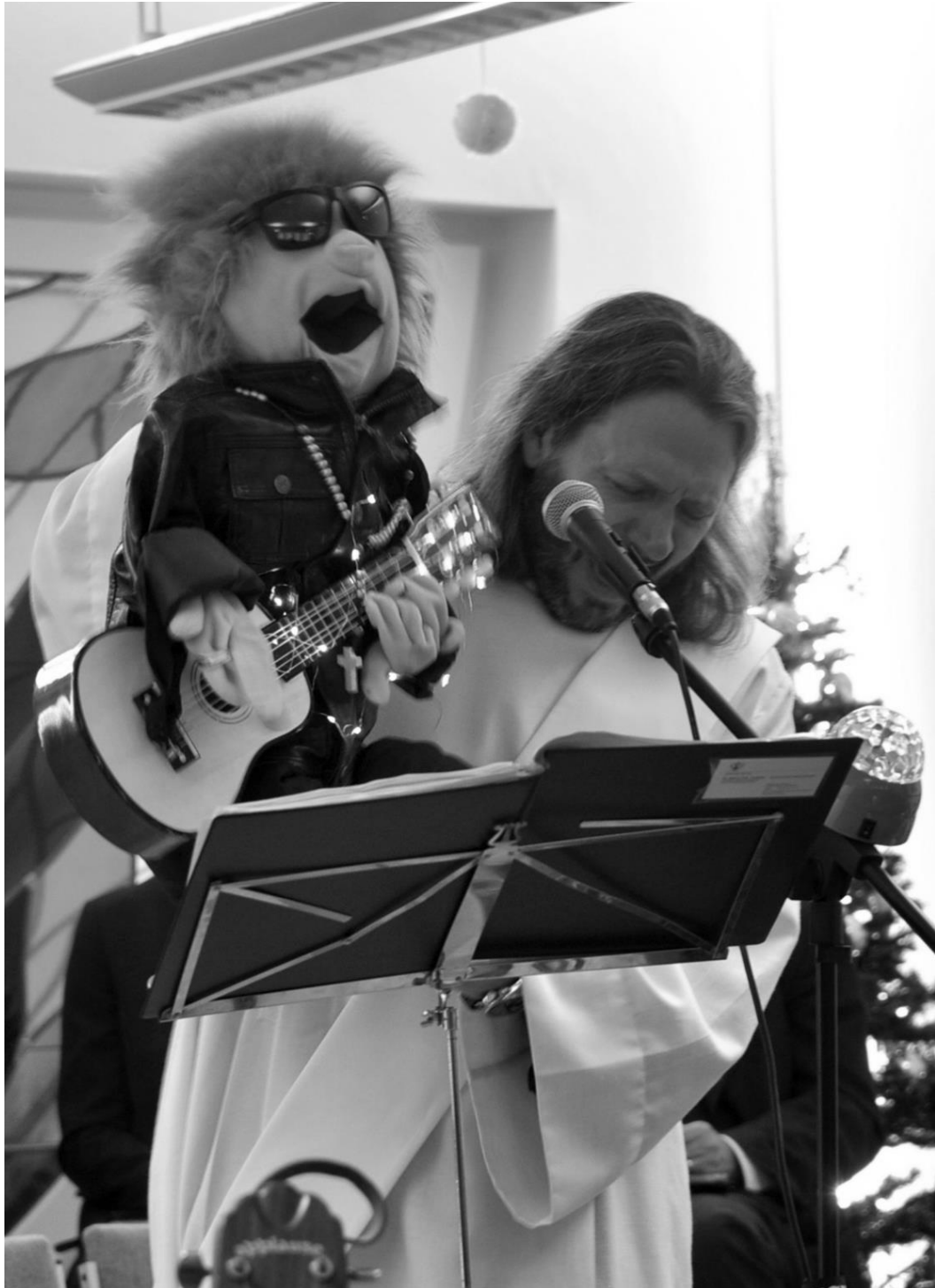
‘The Scream of Art’ – Poetical puppeteering behind bars (private collection).