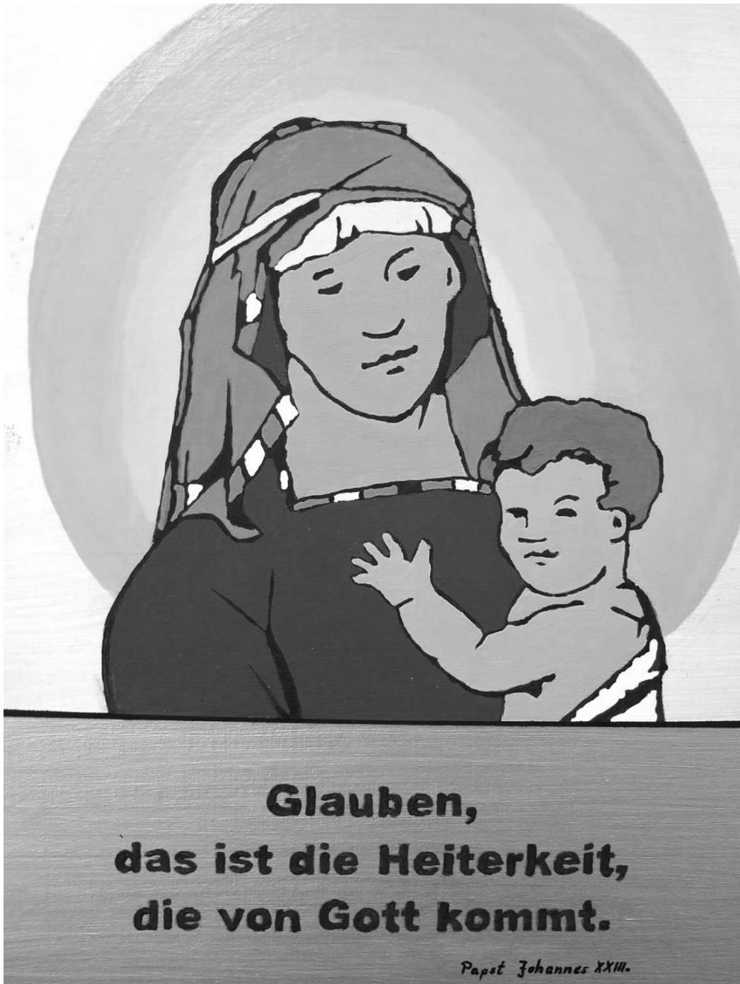
Expressions of faith in a prisoner's painting (private collection).