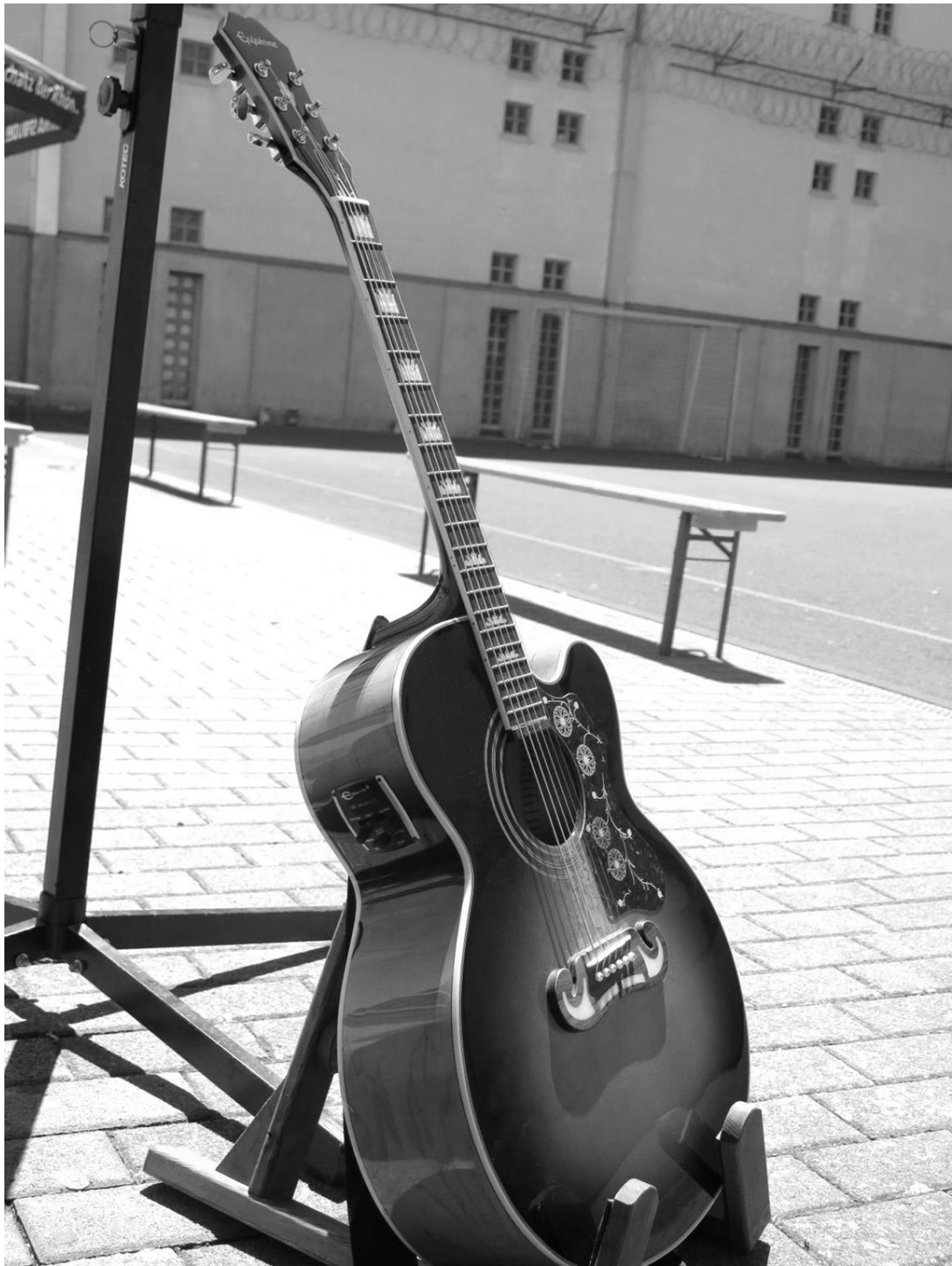
Theology of Empowerment through music, literature and art (private collection).