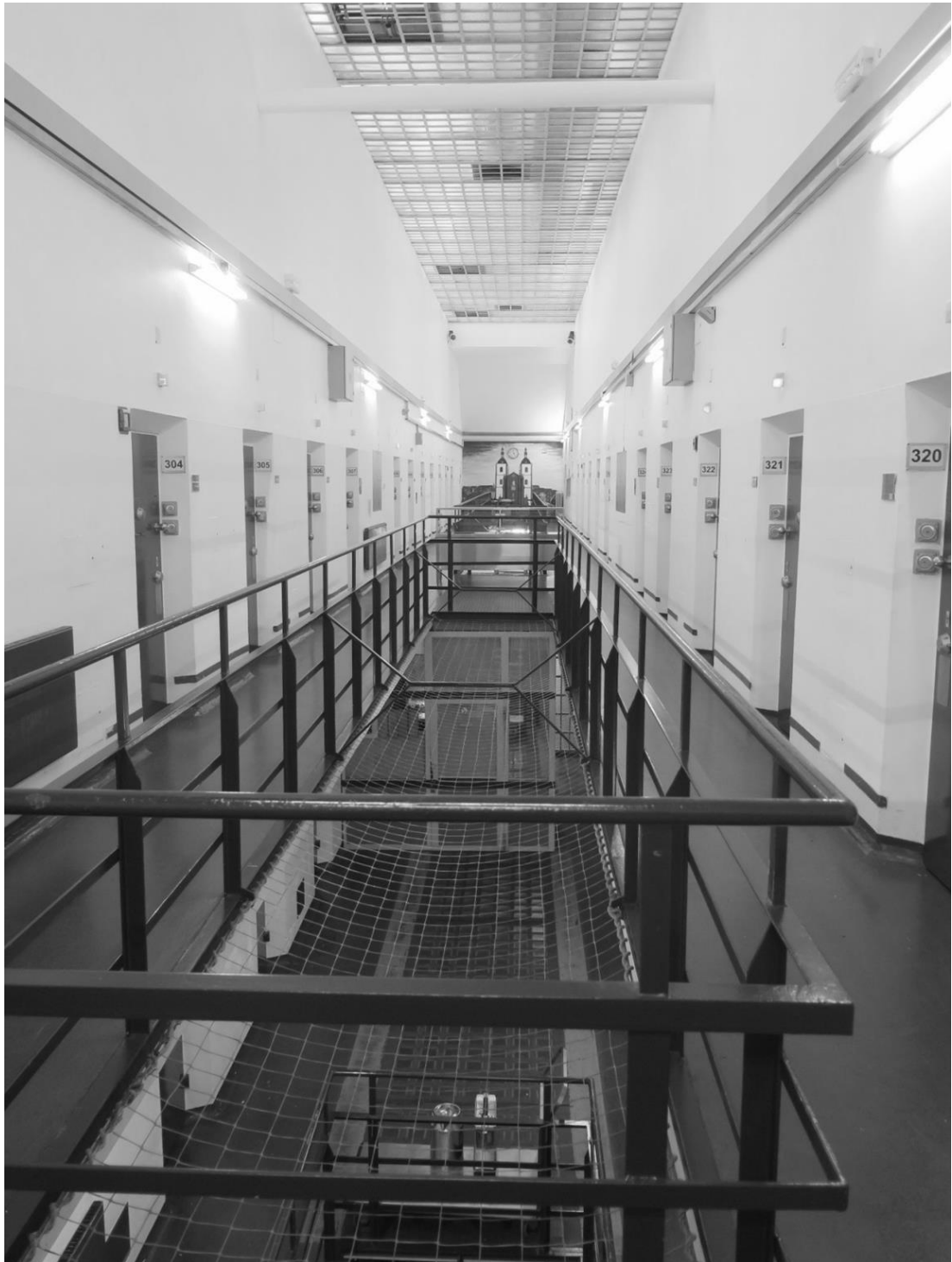
Fulda Prison, Germany (private collection).