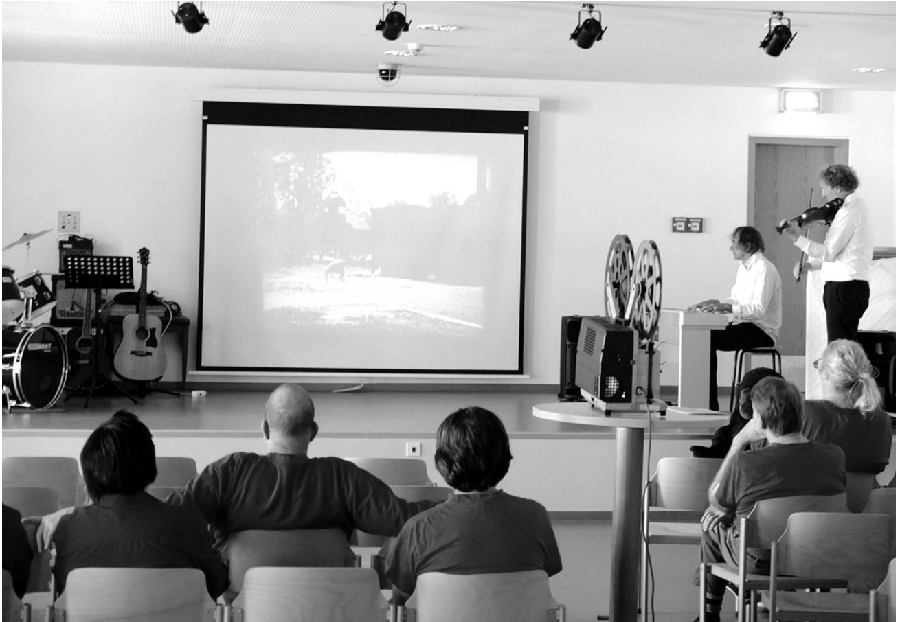
Jail Cinema – Silent film with Charlie Chaplin as prisoner (private collection).