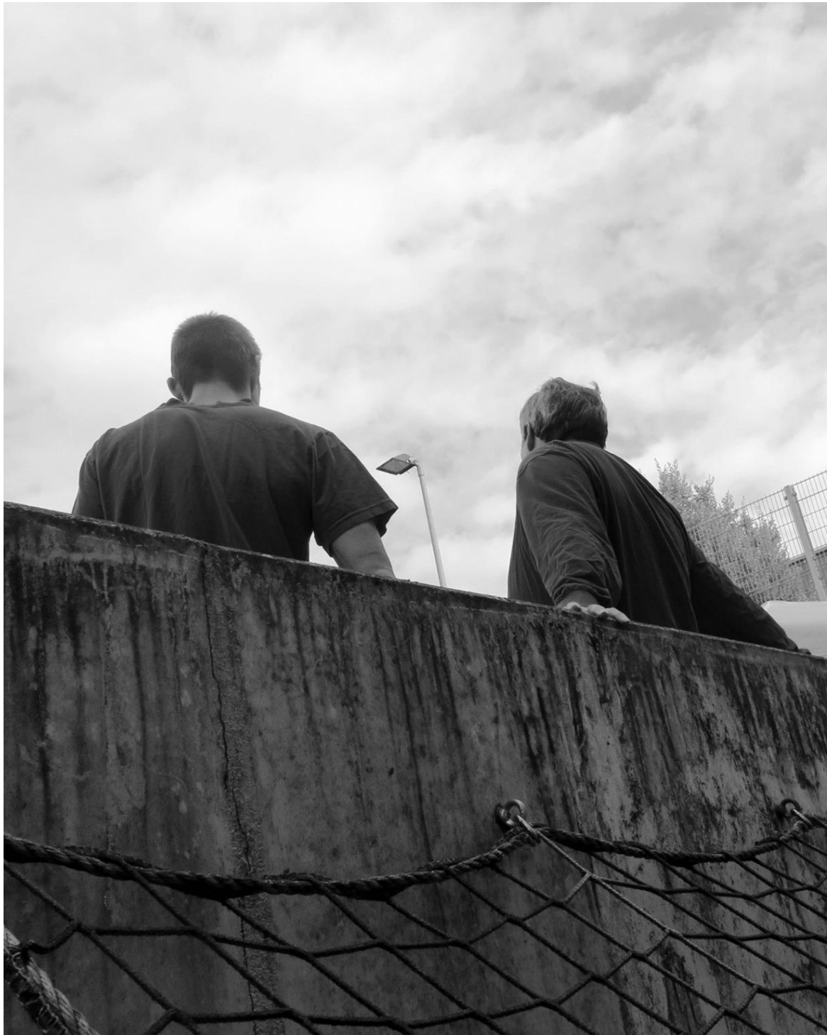
Prisoners and the search for meaning (private collection).