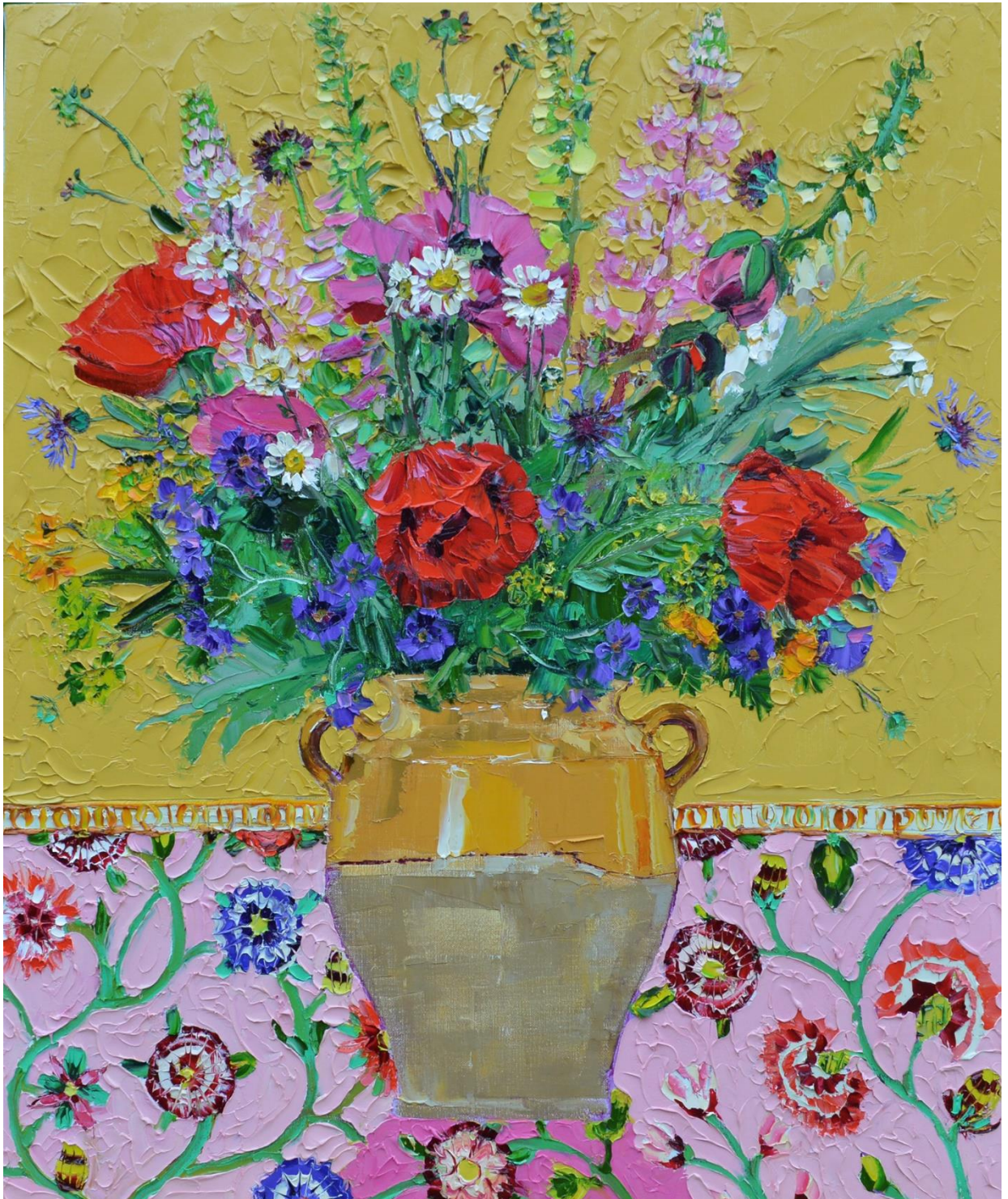
June garden flowers 91 x 76 cm Oil on canvas