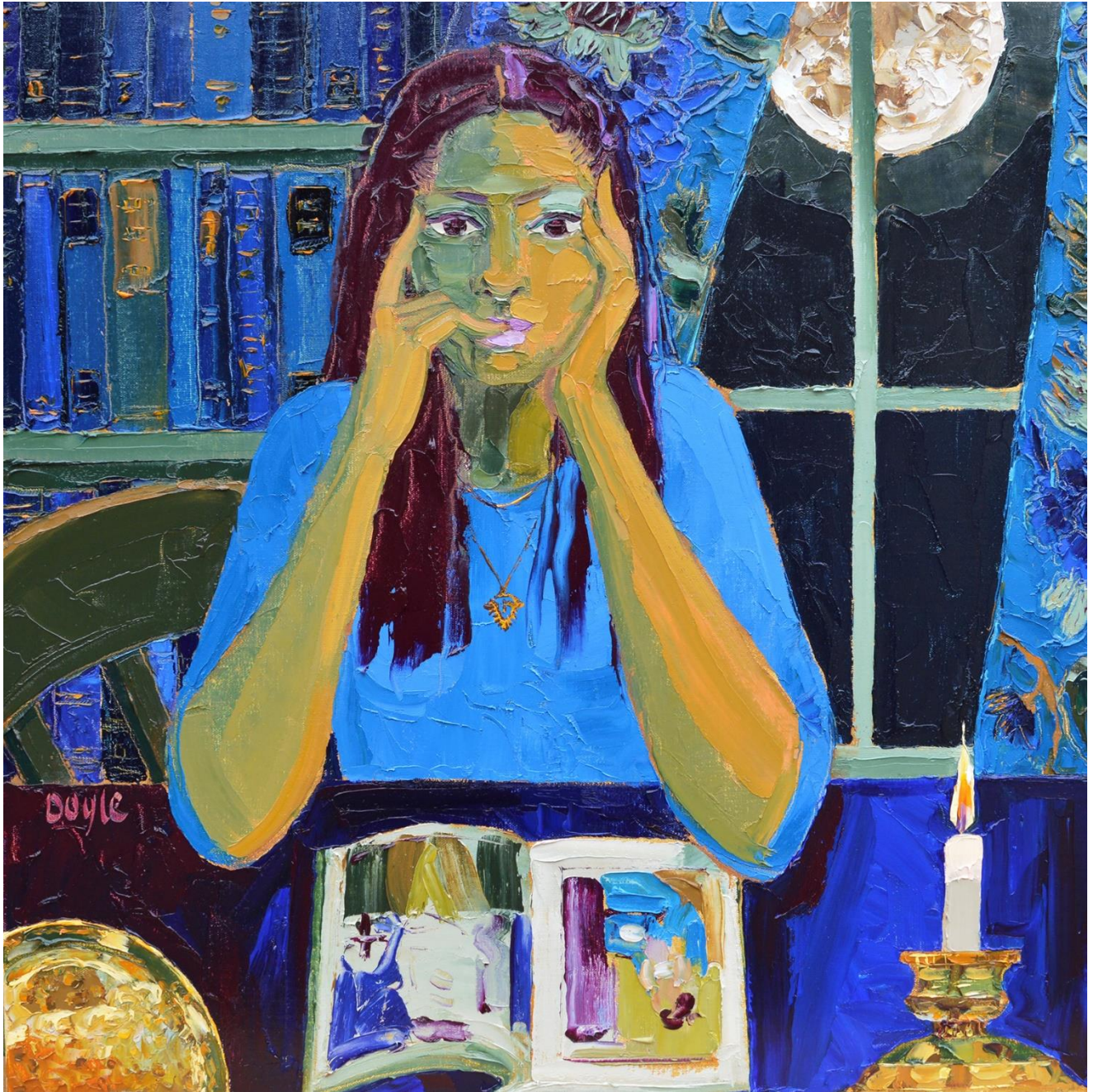
January moon 71 x 71 cm Oil on canvas