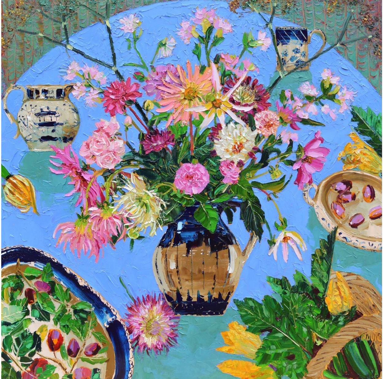
September garden 91 x 91 cm Oil on canvas