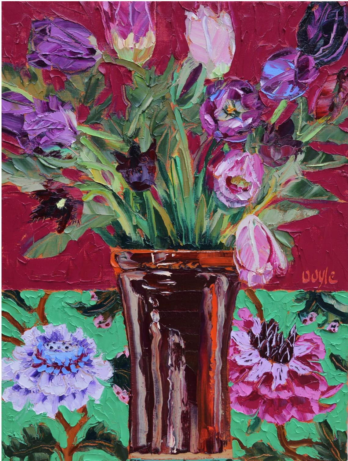
May tulips 61 x 46 cm Oil on canvas