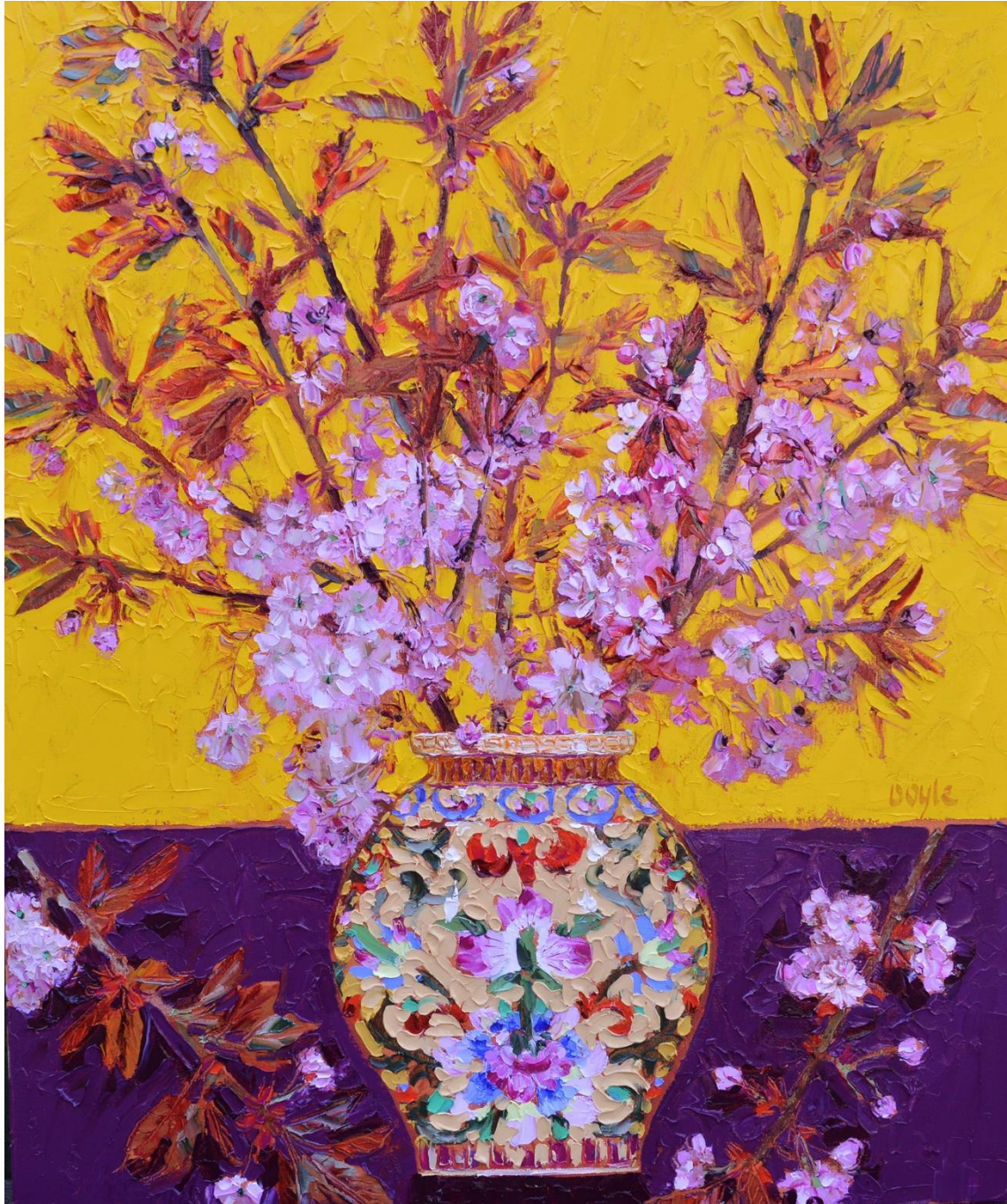
Cherry blossom 91 x 76 cm Oil on canvas