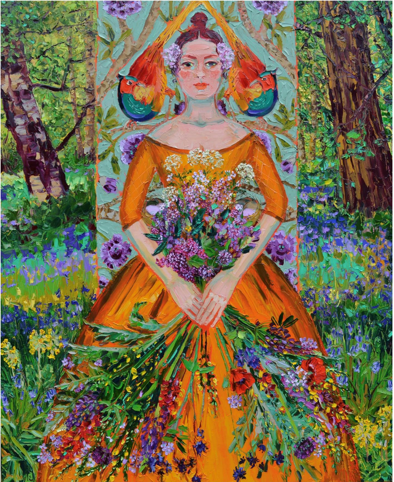
May queen 152 x 122 cm Oil on canvas