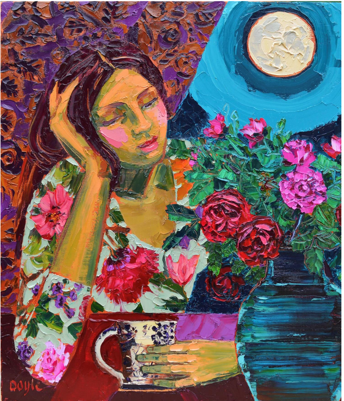
November roses 71 x 61 cm Oil on canvas