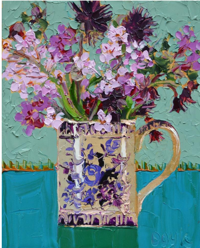
Garden diary series 25 x 20 cm Oil on canvas