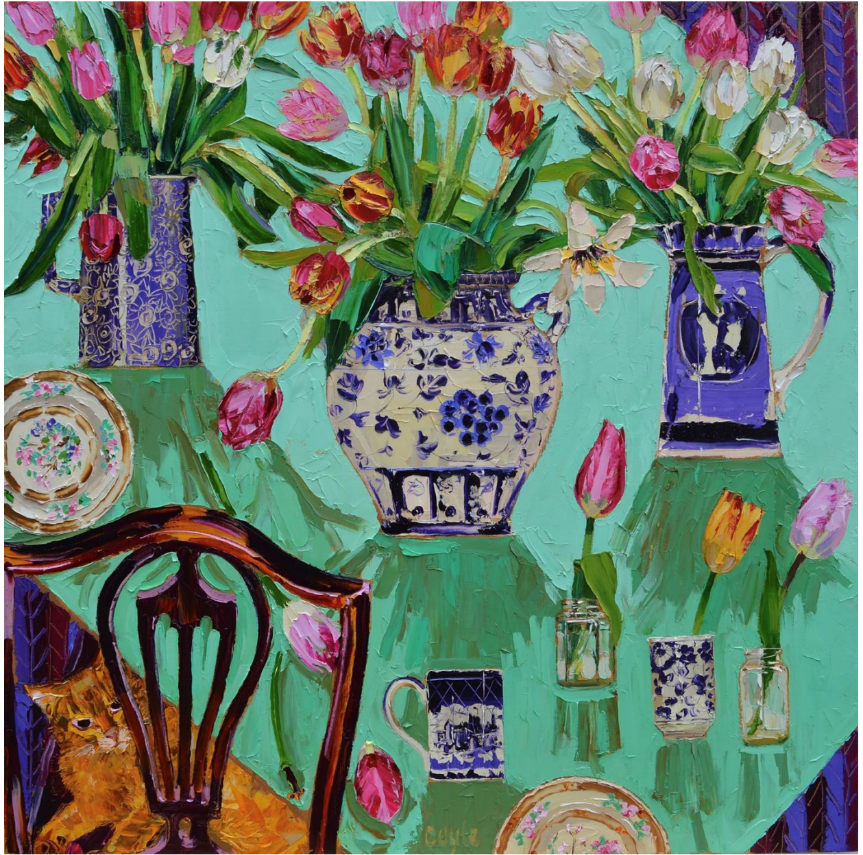
April tulips 91 x 91 cm Oil on canvas