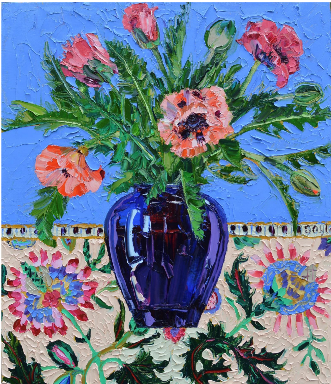
Oriental poppies 71 x 61 cm Oil on canvas