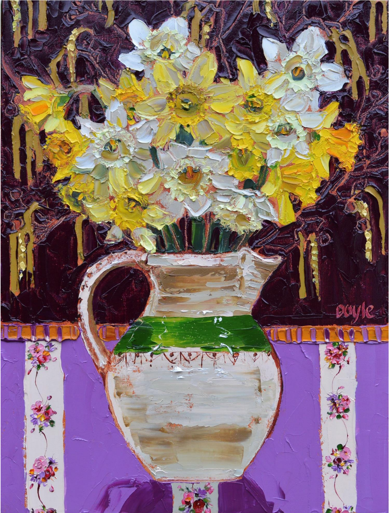
Daffodils 61 x 46 cm Oil on canvas