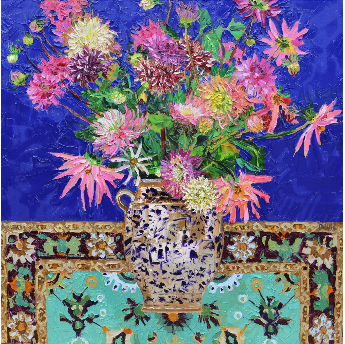
August dahlias 91 x 91 cm Oil on canvas