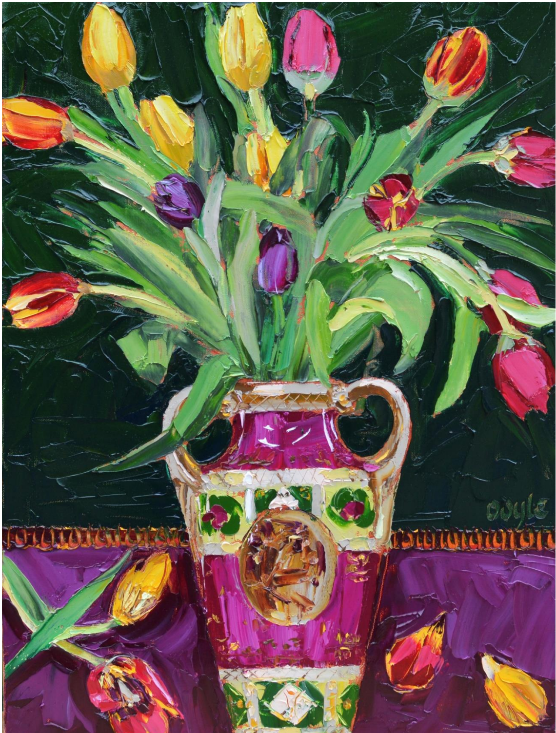
Mixed tulips 61 x 46 cm Oil on canvas