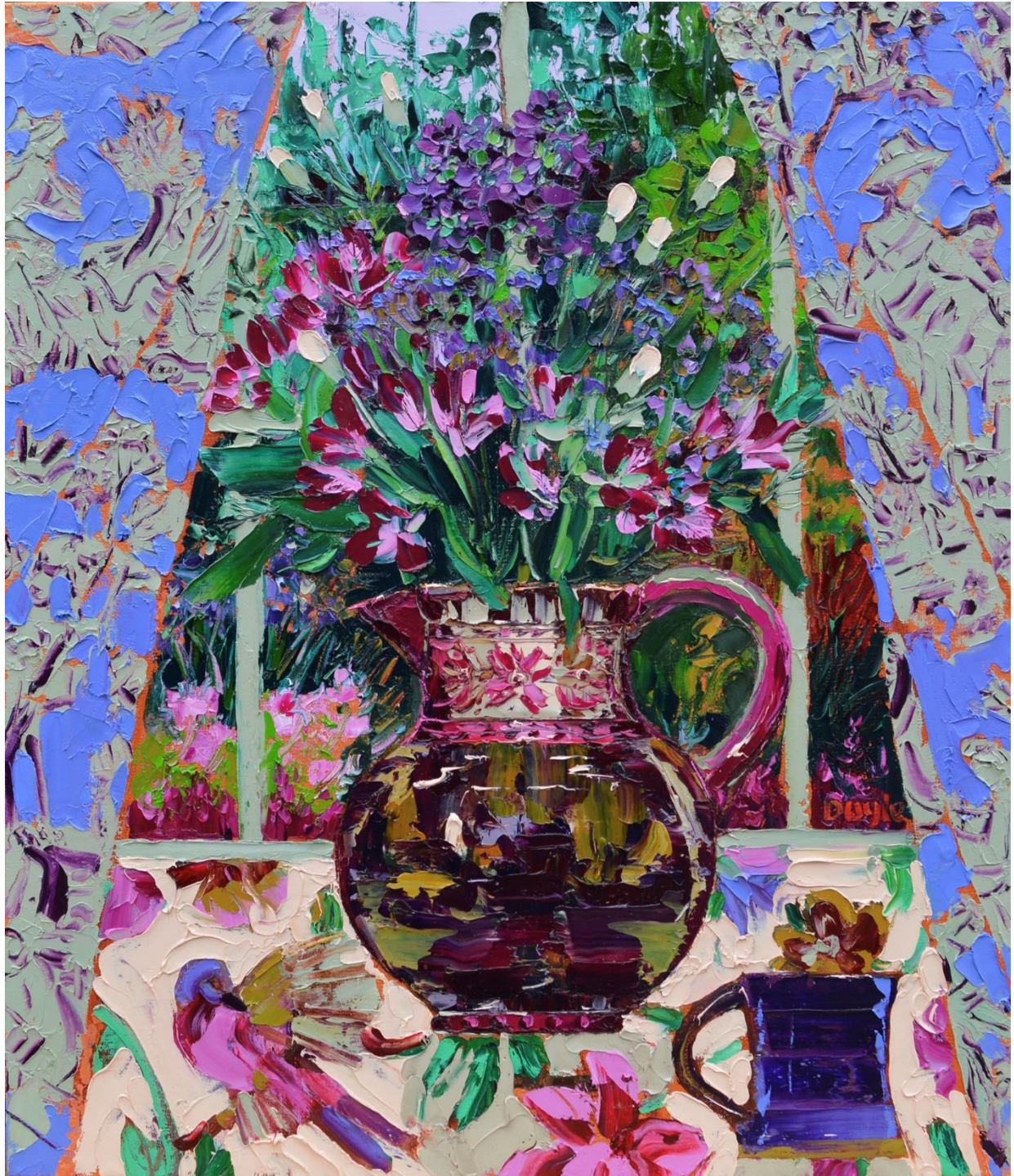
Birthday flowers 71 x 61 cm Oil on canvas