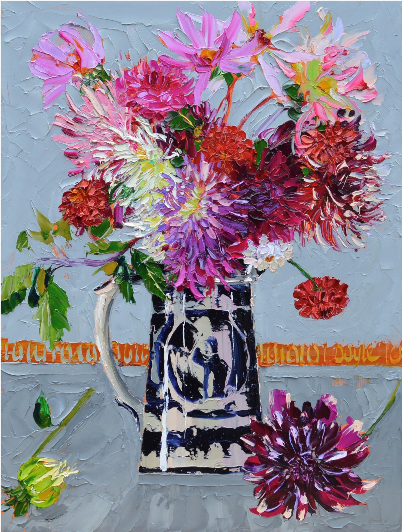
Dahlias on grey 61 x 46 cm Oil on panel