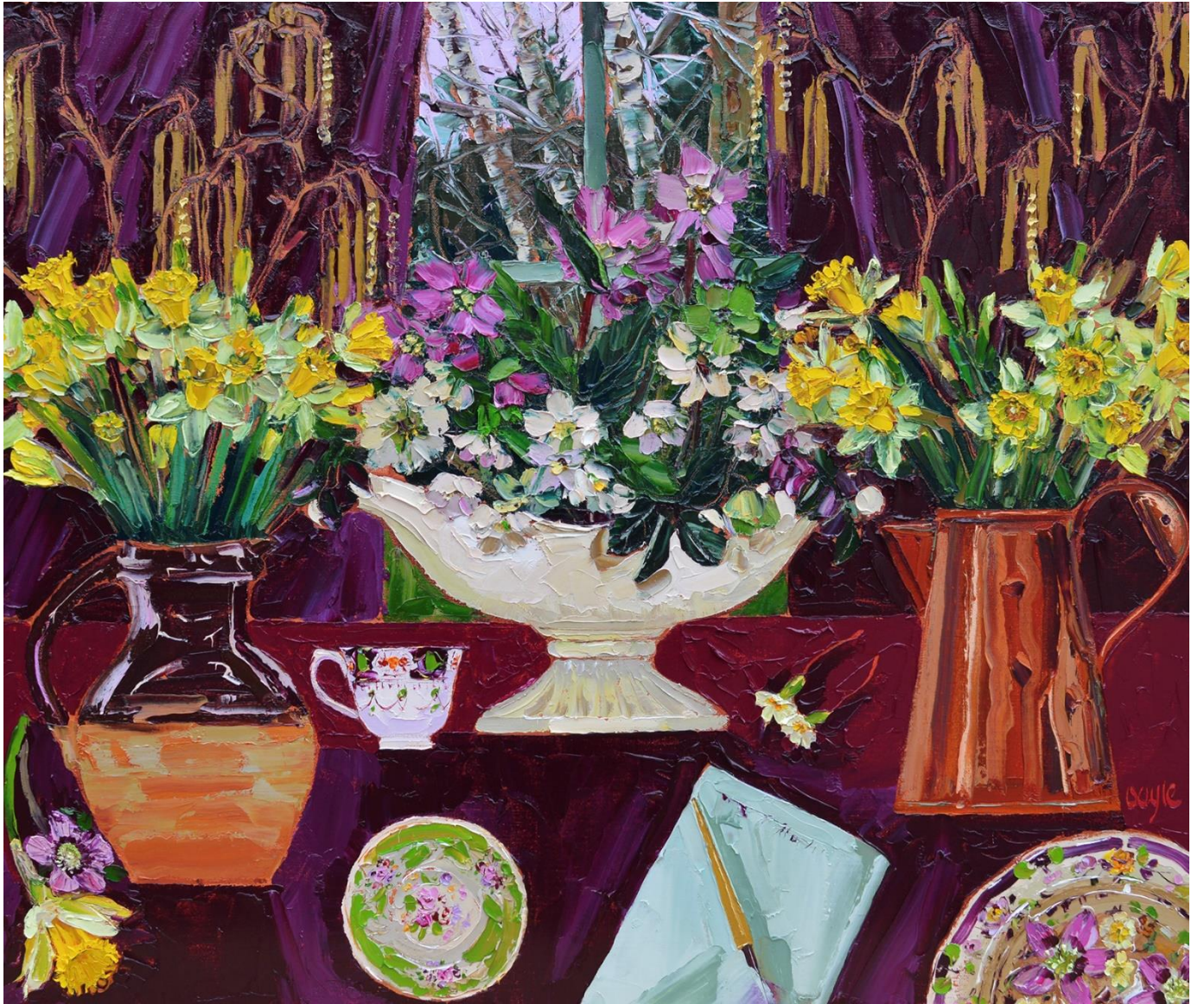
Ode to Spring 76 x 91 cm Oil on canvas